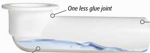
One less glue joint

TAPERED DESIGN Drains faster & helps prevent standing water / mold