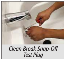
Clean Break Snap-Off Test Plug