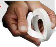
Double Adhesive Overflow Washer For One Man Installation