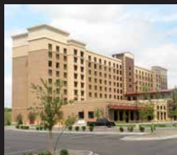
Lodging and Hospitality