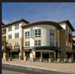
Mixed Use Development